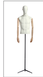
max height 190 cm