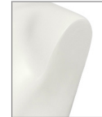
No shoulder cap